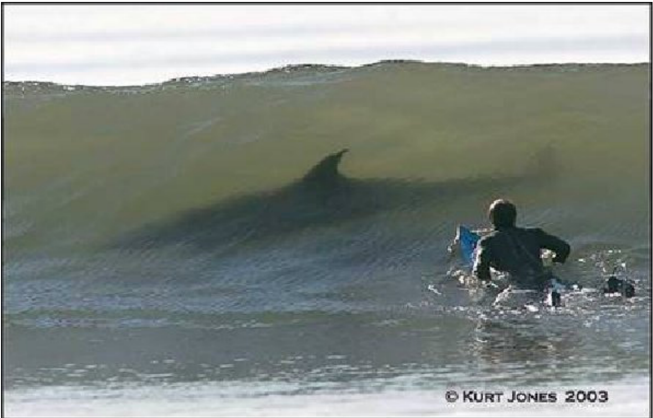
The Surfer who should have become a Windrush sailor