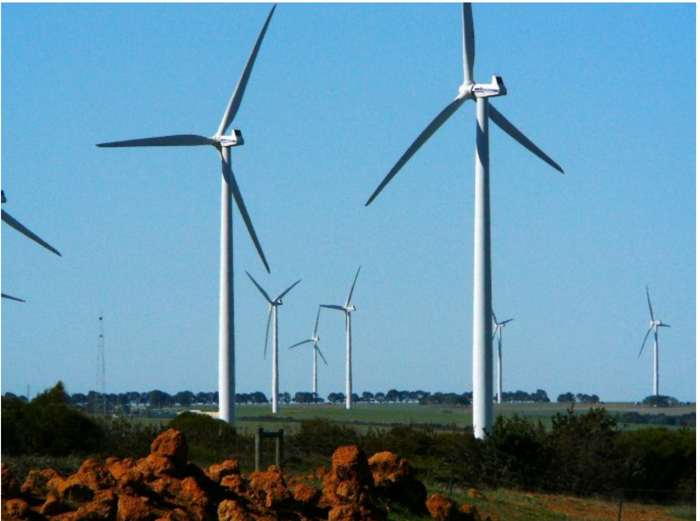
ALINTA WIND FARM AT WALKAWAY JUST SOUTH OF GERALDTON