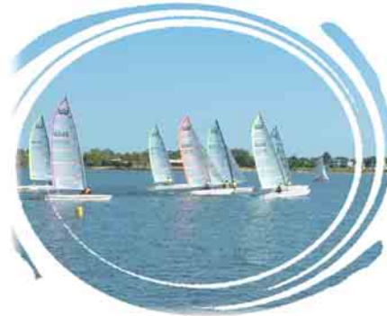
Heat start at convict bay regatta