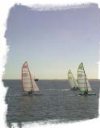
Junior sailors racing in The bay at the front of the club house