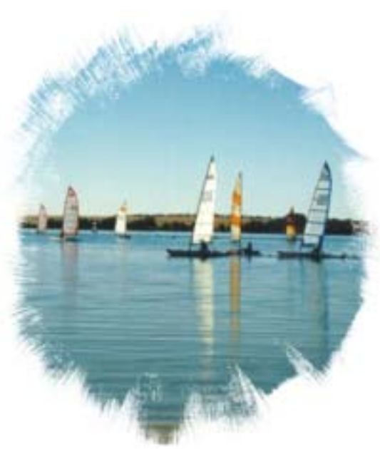
Sailing at Hagboon lake in a lighter moment