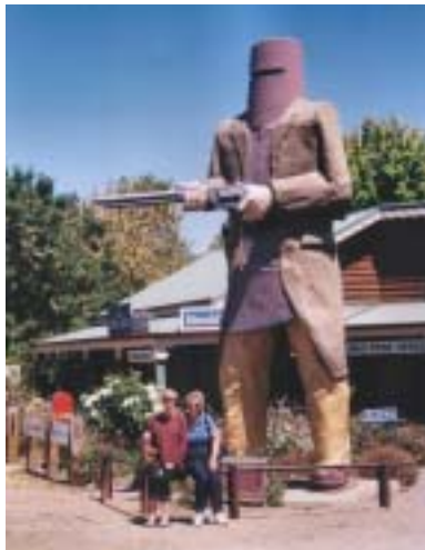
Ned Kelly, An Australian Icon