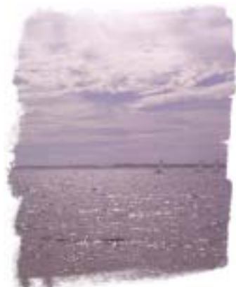
Scene across the bay from the sailing club