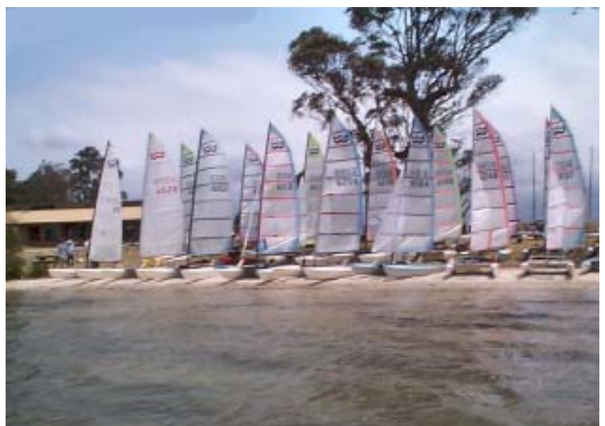
At the Nationals Coila Lake - Tuross Head NSW