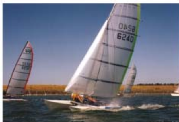
Windrush racing at Hagboon Lake 2001